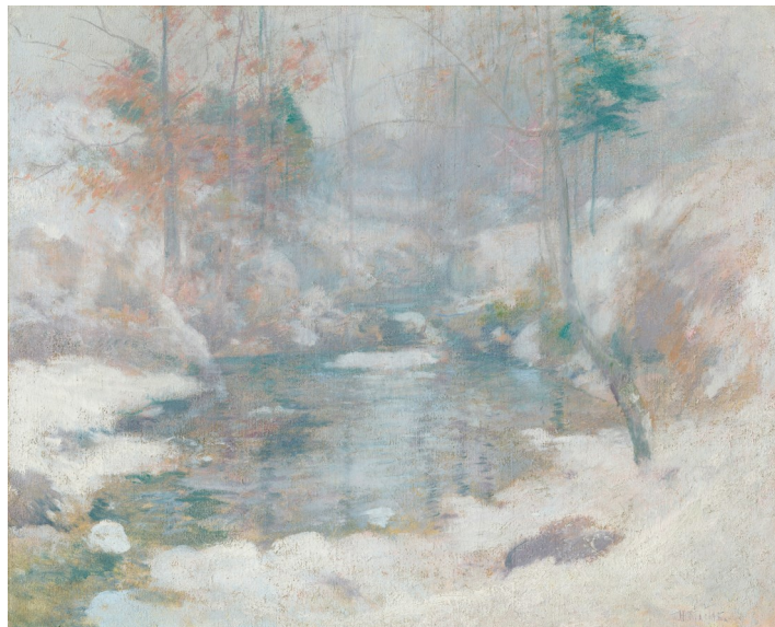
Winter Harmony by John Henry Twachtman, 1890/1900, oil on canvas. Gift of the Avalon Foundation

This poem is in the public domain. Published in Poem-a-Day on January 2, 2022, by the Academy of American Poets.